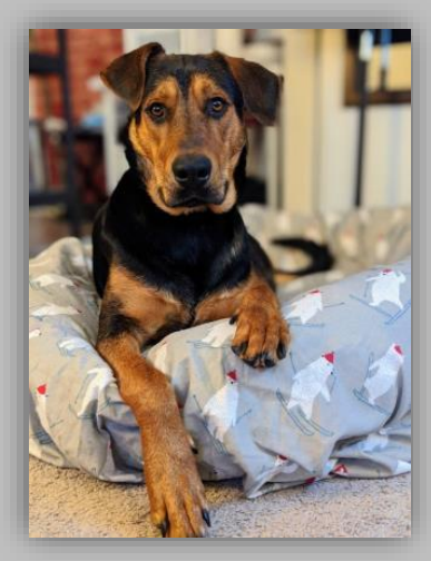
Our sweet Bubba Lou! Please refer an adopter.